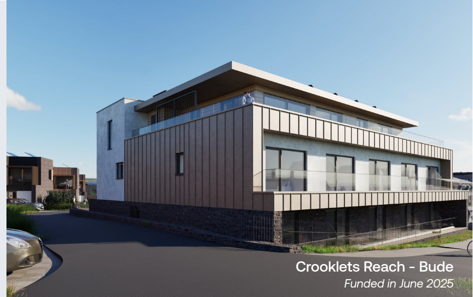
Crooklets Reach - Bude Funded in June 2025